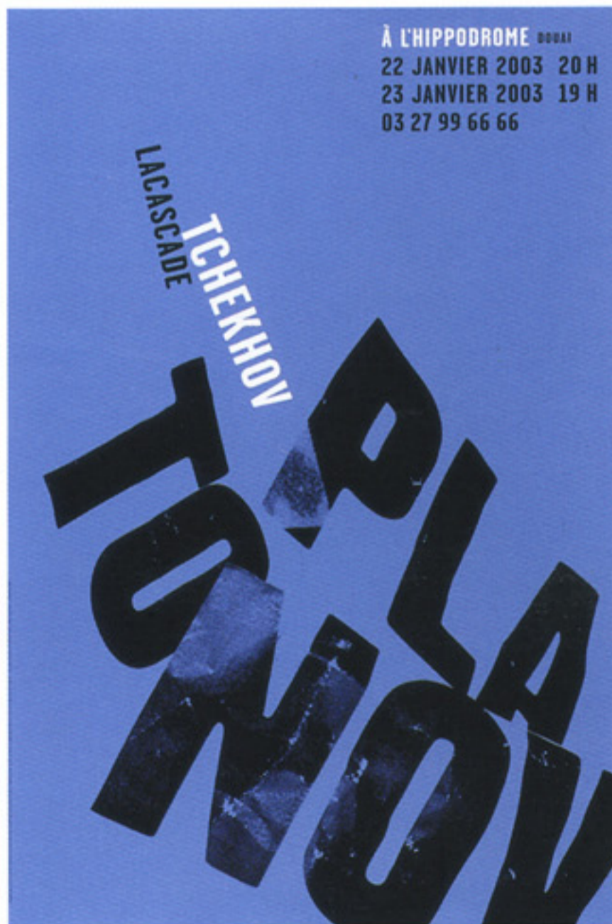
Platonov - 2002 - France